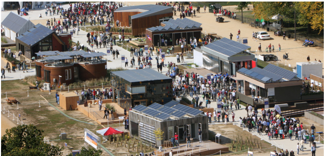
DOE Solar Decathlon International Competition featured energy efficient, solar-powered houses built by 20 university teams.