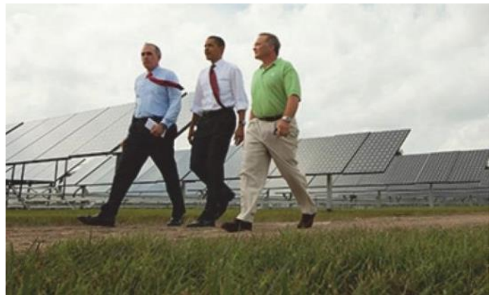
The President has taken the unprecedented action to build the foundation for a clean energy economy, tackle the issue of climate change, and protect our environment.

The IWG EJ NEPA Committee was established to develop an integrated process for implementing EJ considerations and NEPA compliance by federal agencies. DOE's Office of NEPA Policy and Compliance represents the Department on the NEPA Committee. Through this committee, DOE contributed to the development of the 2016 report, Promising Practices for EJ Methodologies in NEPA Reviews . DOE will continue to work with other agencies to use the report, implement the training, and share lessons learned.