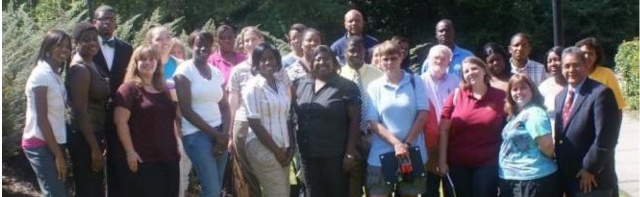
Faculty and students at the community workshop at Savannah State University.

resources on Title VI and EJ will be shared during the outreach events. The Department will conduct presentations and share information on EJ with attendees and compile community feedback received during and following outreach events to form future outreach strategies and public education materials.