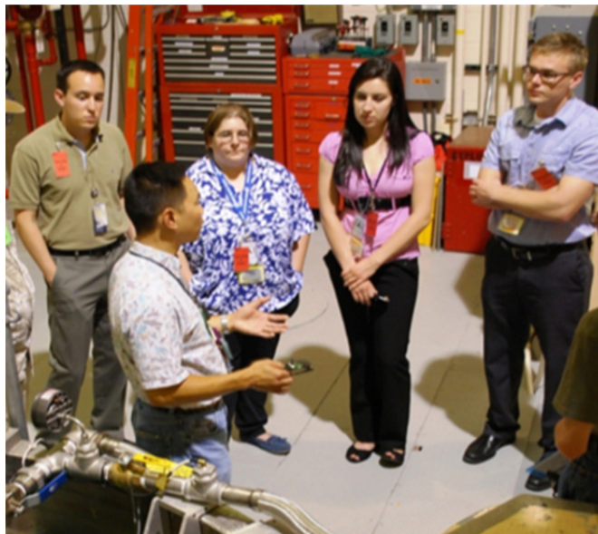
Summer interns tour Sandia National Laboratory.

Objective 4: Conduct educational outreach for communities and stakeholders