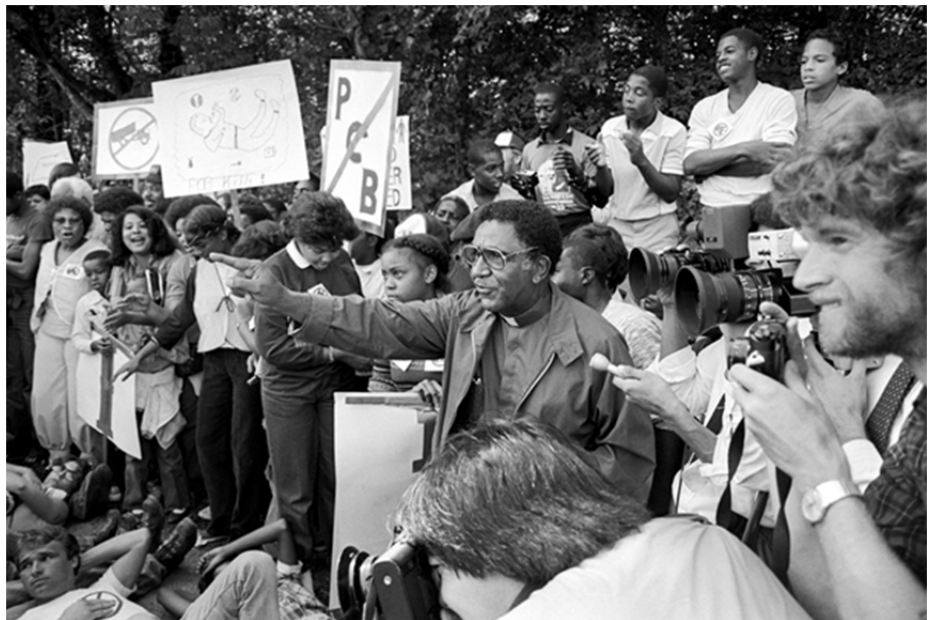
Citizens in Warren County, North Carolina, protest siting of a hazardous-waste landfill in their community.

The Warren County protest and the emerging EJ movement served as the impetus for a number of studies designed to measure the connection between race and hazardous waste siting decisions. The General Accounting Office (GAO) reviewed the hazardous-waste-siting decisions in the Environmental Protection Agency (EPA) Region IV. This region includes Alabama, Florida, Georgia, Kentucky, Mississippi, North Carolina, South Carolina, and Tennessee—