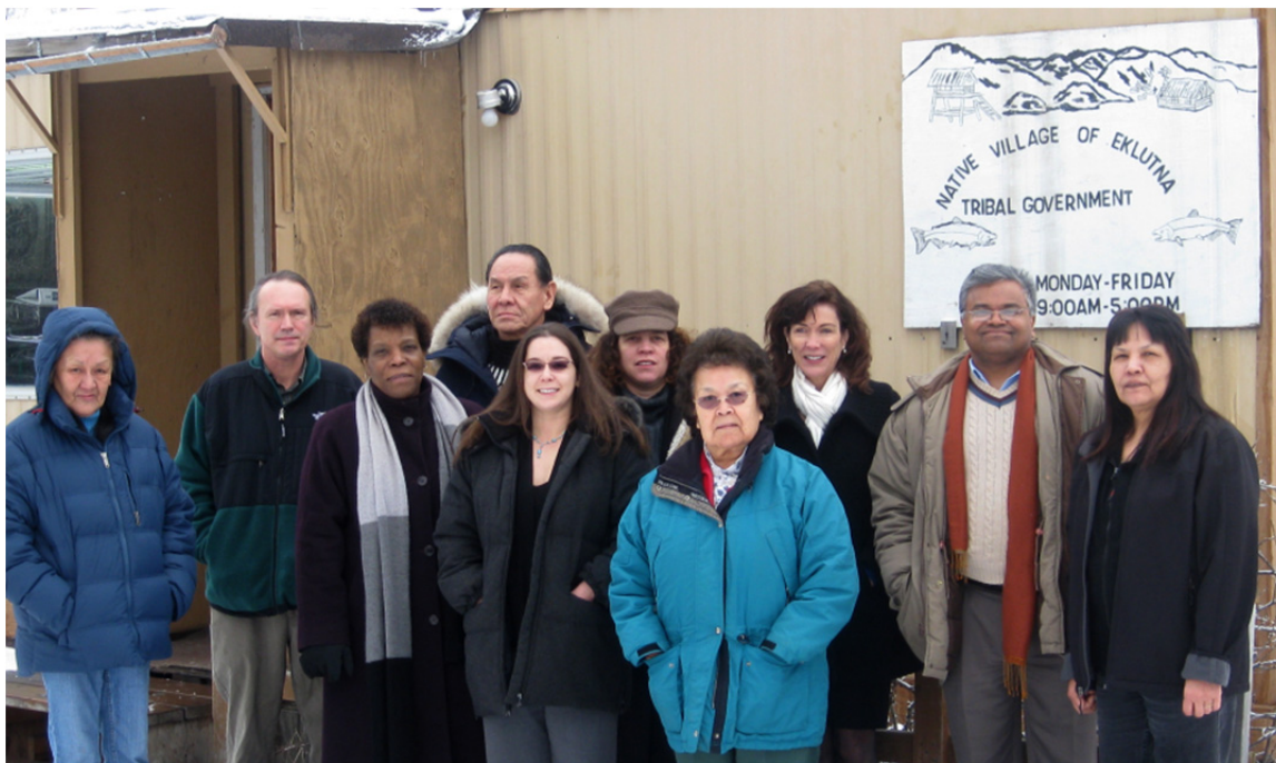
Interagency Working Group on Environmental Justice – Alaska Forum/site visit

The Department welcomes renewed efforts to elevate EJ issues and increase interactions with minority and low-income communities.