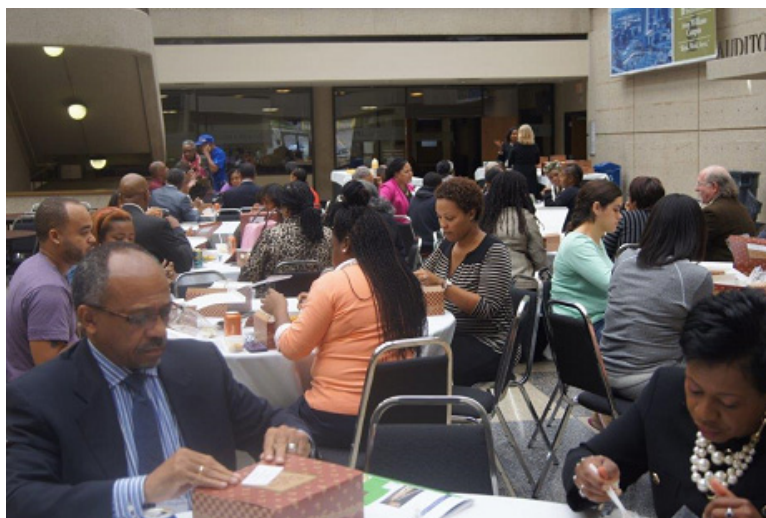
Audience attending Tennessee State University's Community Leaders' Institute.