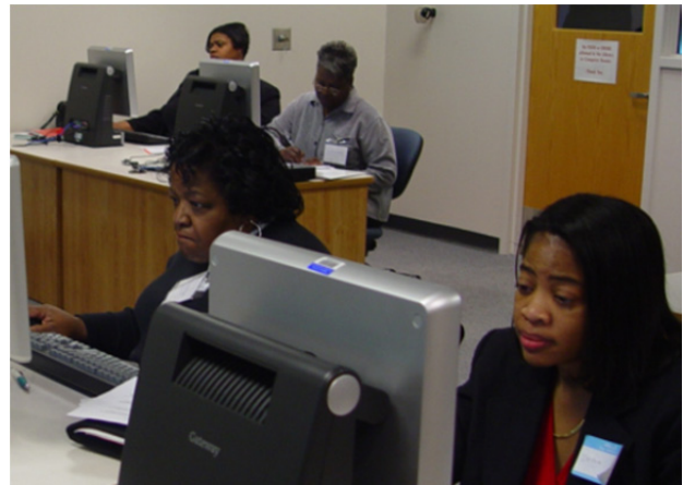
Technical assistance community workshop.

The Department will develop guidance for DOE-funded, worker-training programs that are designed to assist disadvantaged communities in proximity to DOE facilities. 4 The guidance will include information on innovative techniques to improve the effectiveness and efficiency of these programs. Through interagency collaborations, DOE will also provide model strategies to address barriers to