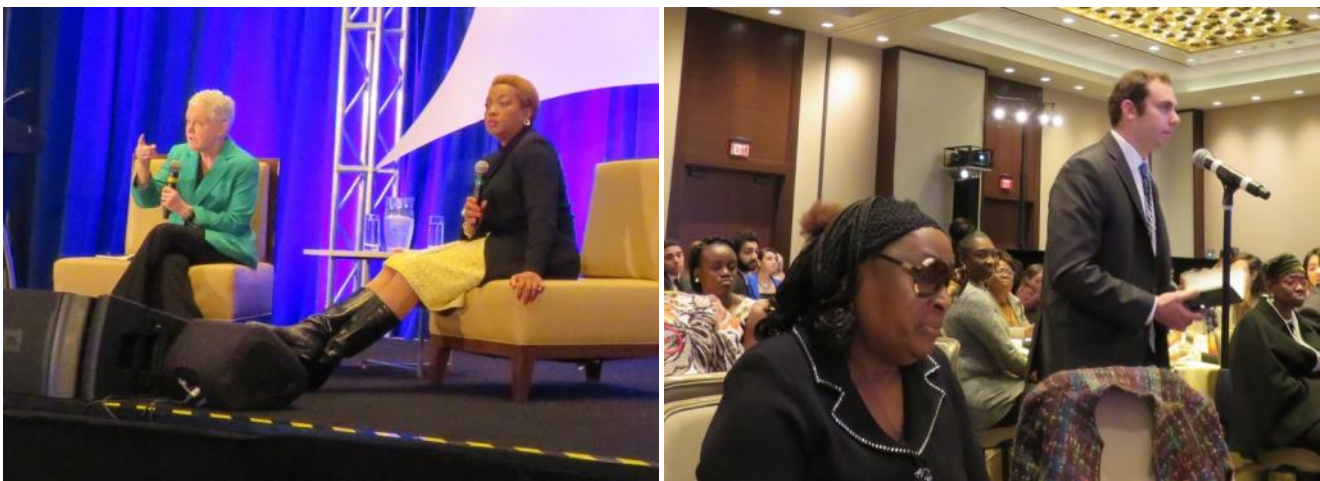
U.S. Environmental Protection Agency Administrator, Gina McCarthy (left) and 2016 National Environmental Justice Conference and Training Program attendees during the question and answer portion of a presentation.