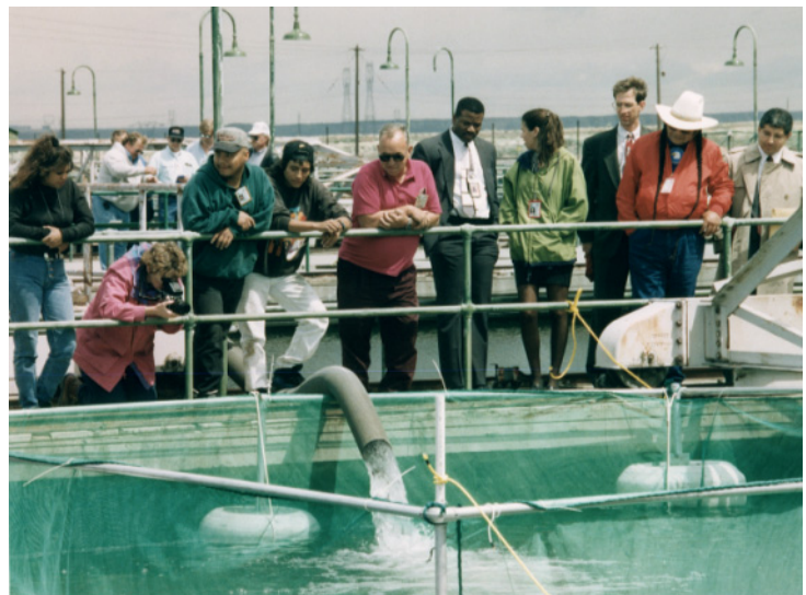
Viewing Chinook salmon at Hanford, Washington.

The Department's EJ program supports a sustainable approach to ensure meaningful involvement and protection for the most vulnerable populations. Some of DOE's initiatives to implement this approach are part of the Department's key programs, including: Clean Energy; Weatherization; Cleanup; Beneficial Land and Property Development and Reuse; Climate Change; training; and a youth program, including internships in Science, Technology, Engineering, and Mathematics (STEM) education. The details are spelled out in DOE's Environmental Justice Five-Year Implementation Plan . 1