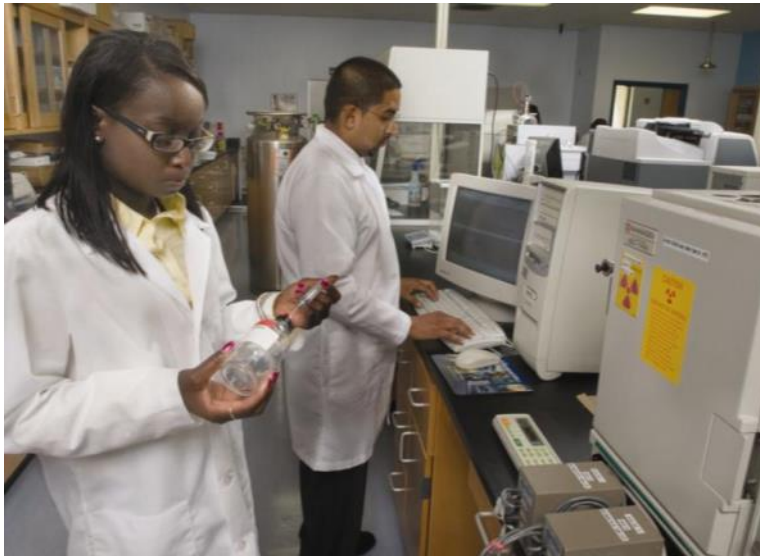
Interns monitor environmental contaminants in a laboratory setting.

DOE prepared a comprehensive history of its major EJ accomplishments since February 11, 1994, the issuance date of EO 12898, and disseminated the report to the public. 9