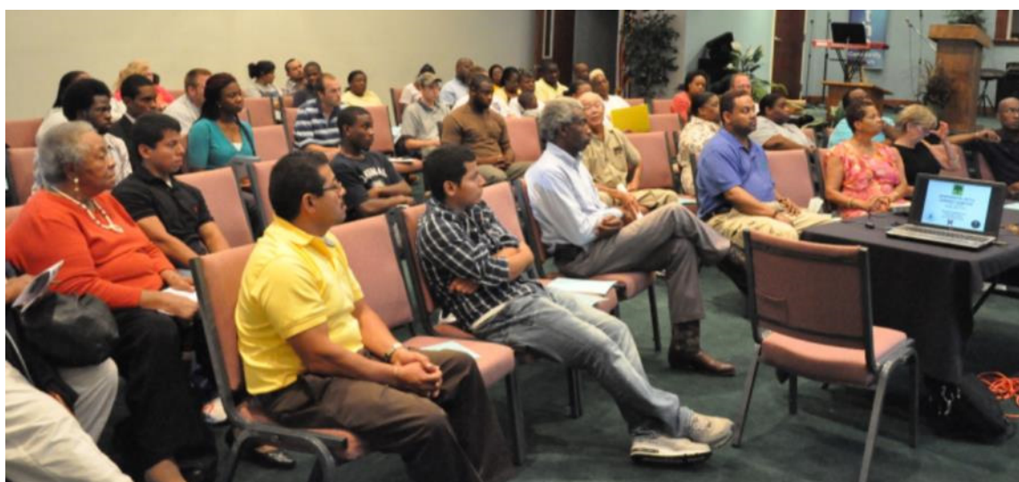
Teaching Radiation, Energy, and Technology (TREAT) Workshop.