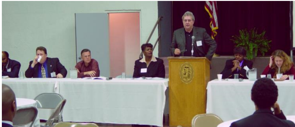
Allendale, South Carolina, Community Leaders Institute.

In 2016, the Department is pleased to update and implement its newly revised Environmental Justice Strategy (EJ Strategy), which seeks to demonstrate the Department's commitment to comply with Executive Order (EO) 12898, Federal Actions to Address Environmental Justice in Minority Populations and Low-Income Populations .