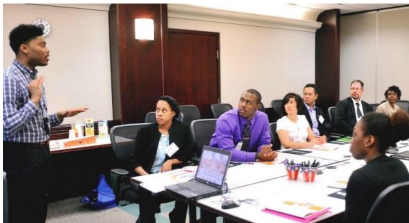
Sharing the National Nuclear Security Administration and DOE mission

successful program implementation (e.g., trainees who lack access to transportation, who have low educational attainment, or have experienced legal problems in the past).