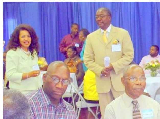
Community Leaders Institute held in Bamberg County, South Carolina.