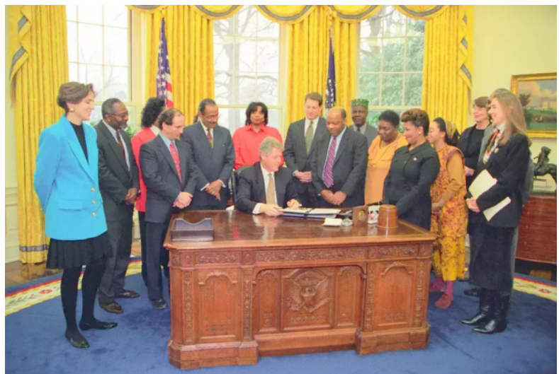
President William J. Clinton signed EO 12898 on February 11, 1994.

In 1994, President Clinton issued Executive Order 12898, Federal Actions to Address Environmental Justice in Minority Populations and Low-Income Populations .