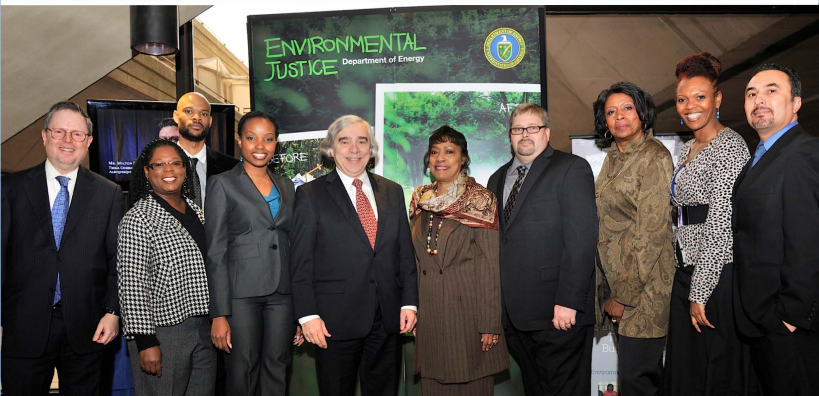
DOE Secretary Moniz (fifth from left) and members of the DOE EJ Task Force celebrate the 20-year anniversary of EO 12898.

The U.S. Department of Energy is a federal leader in Environmental Justice. In the pursuit of our mission and goals, we treat people fairly and achieve early and meaningful involvement by our affected communities and broader stakeholder populations.