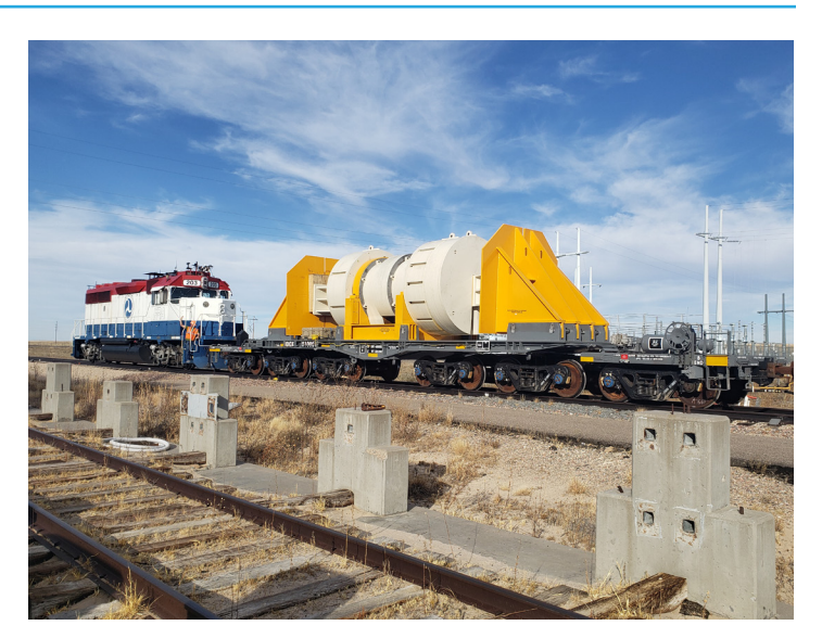
Atlas SNF railcar with test weights on test track.

DOE estimates it will take about 8 years of railcar development and testing to verify that all of the new railcars meet the S-2043 standard, and receive approval from the AAR.