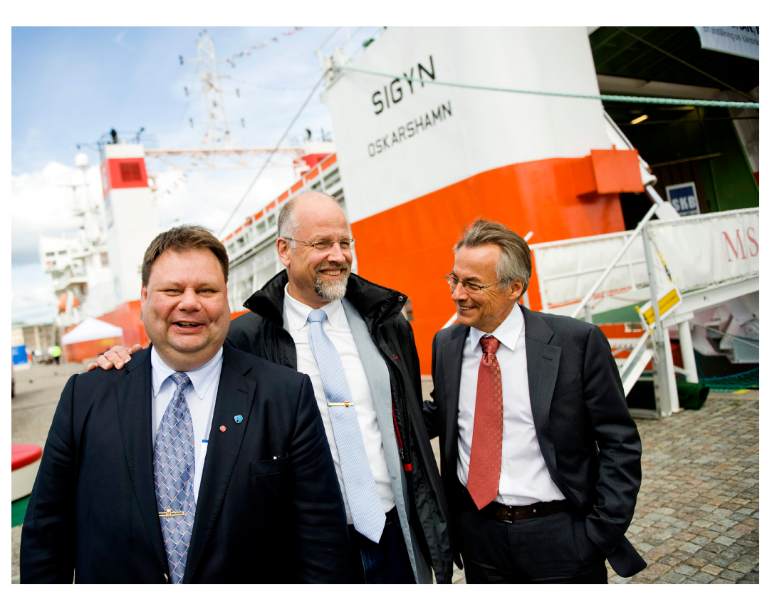
SKB\ informs\ the\ mayors\ from\ two\ candidate\ municipalities\ of\ its\ site-selection\ decision.\

Although the four sites have different geologic properties, they did not differ appreciably in terms of their long-term ability to isolate and contain SNF. Nor did the sites differ substantially in the geotechnical work needed to build the facility, the ease in which it could be expanded, infrastructure requirements, or costs. Because Eurajoki and Loviisa host nuclear power plants, their residents were less fearful of the transport of SNF through their communities and were more generally accepting of a repository. Developing a deep-mined geologic repository in Kuhmo and Äänekoski