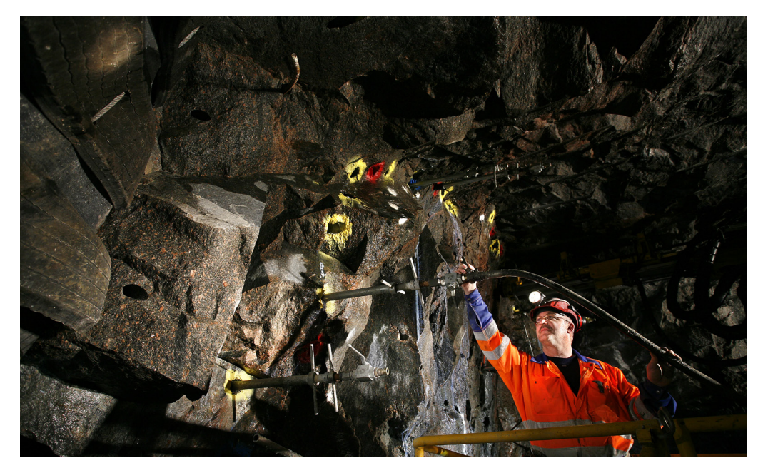
Determining the suitability of granite as a host rock.

combination of these rationales. In Sweden and Finland, efforts were concentrated exclusively on the granitic formations of the Baltic Shield, which underlies the vast majority of both countries (Sundqvist 2002). In their early attempts to identify a candidate site, the United States and Germany looked only at locations in salt formations. The United States investigated sites near Lyons, Kansas, and in the Permian Basin in the southwest. The Germans chose a site at Gorleben. Because of the