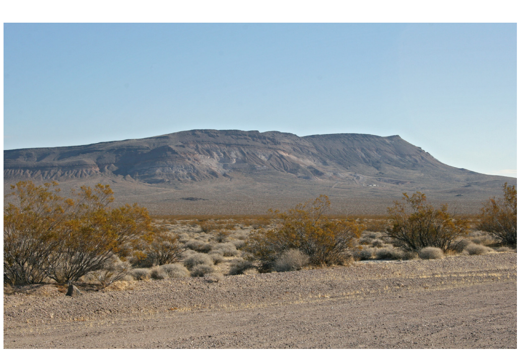
View of Yucca Mountain from Busted Butte.

The United States is the only country that has developed a safety case for disposing of HLW and SNF in a deep-mined geologic repository located in unsaturated volcanic tuff. That safety case was developed by DOE in parallel with the characterization of a specific site located at Yucca Mountain in Nevada. The safety case rests on two main pillars. First, engineered barriers minimize the amount of water that can come in contact with the HLW and SNF. Second, transport of radionuclides to the biosphere is limited by the amount of