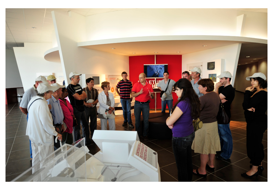
ANDRA personnel explain the French repository design to members of the public.

Two patterns emerged as these questions were answered. First, traditional participatory mechanisms typically were mated with novel and more innovative ones. Second, especially as difficulties arose, many national programs came to recognize the importance the latter mechanisms and began to rely on them. For example, in the United States, participation